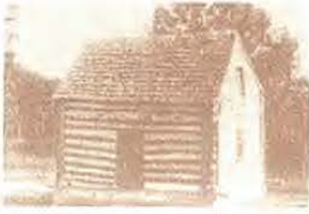
Concordia Log Cabin College - 1839