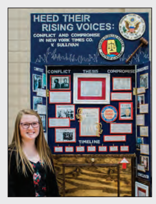
Volunteers Needed Page 4