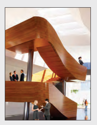
Grand Opening Page 2