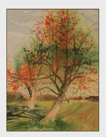
Special Exhibition Page 3