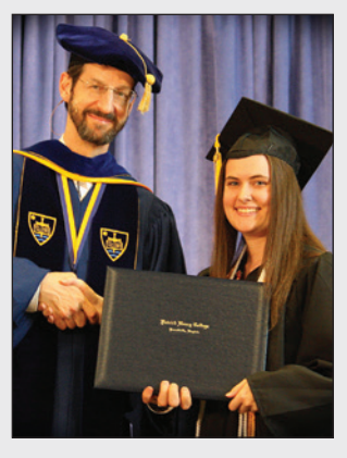
NHDMO Alum Page 4