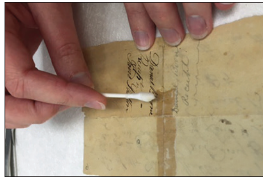
Top SHSMO conservator Erin Kraus uses tweezers to remove adhesive tape from paper. Above Kraus uses a cotton swab to spread a thin layer of methyl cellulose. This chemical compound makes the adhesive resoluble so it can be removed while preserving the paper and ink.