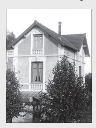
WWII Safe House Page 11