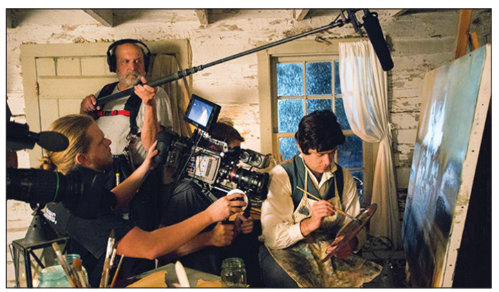
The American Artist crew creates a scene of George Caleb Bingham in his studio.

When Portillo stopped in Jefferson City on July 25, Stack met him at the Capitol to discuss Bingham's painting Watching the Cargo and the prints In a Quandary and The Jolly Flatboatmen . Intrigued by the social and political messages these artworks communicated to nineteenth-century audiences, he asked how Bingham's images of the Missouri River reflected and shaped the public's understanding of the western frontier. The episode is scheduled to air in Great Britain in early 2017. Many PBS stations in the United States are expected to broadcast the program once it is made available internationally.