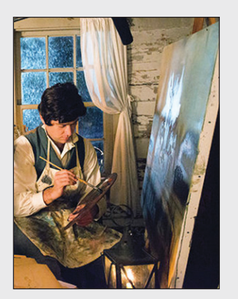
Bingham Films Page 2