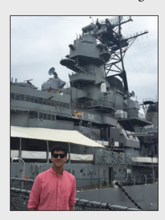
History Day Page 4