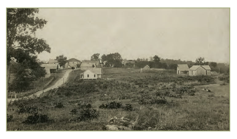
Beulah, Missouri, 1906

The papers in this collection may be the only documentation from the period of Missouri's short-lived pyrite mining boom.