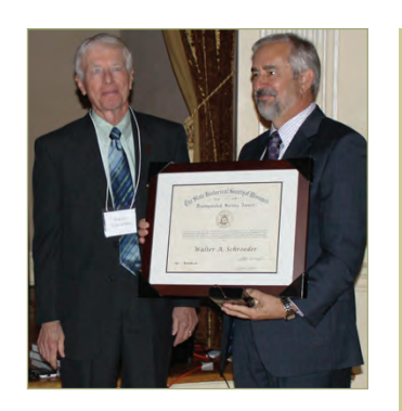
Distinguished Service Award Page 2