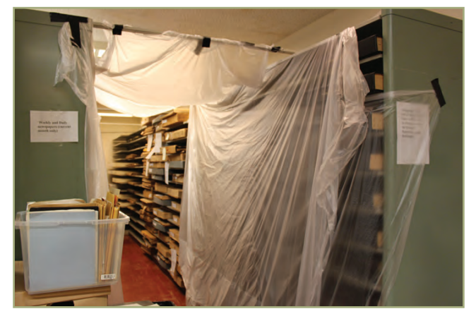
Above: a portion of the newspaper collection on September 10 with tarps moving running water away from historic Missouri newspapers.

Several staff members have been moved to temporary offices in the McReynolds building on campus, and much shifting has taken place among reference, curatorial, and administrative staff members who remain at the Society while reconstruction and clean-up efforts are underway. The staff's main goal during this period has been to continue providing high-quality public service.