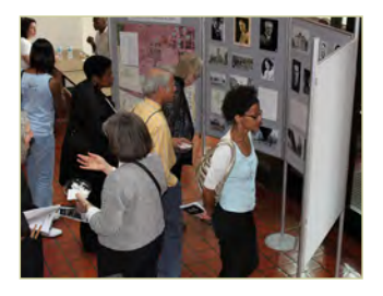
Scott Dedication Page 4