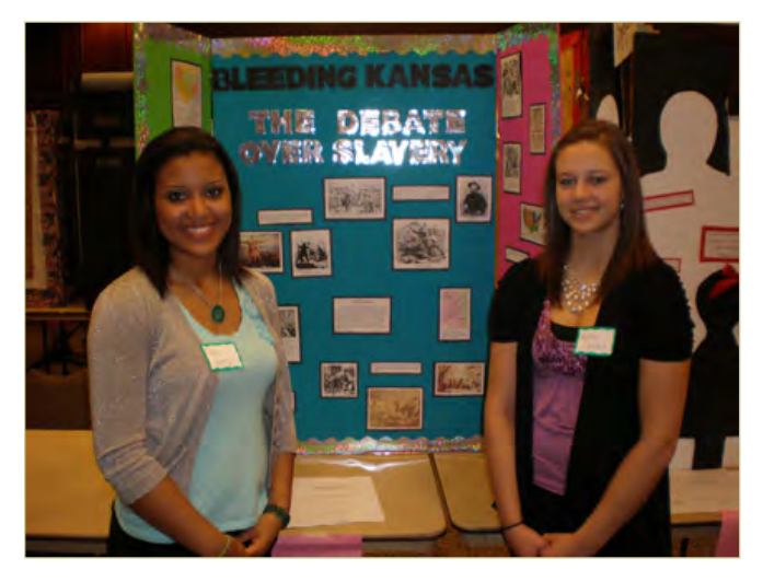
Senior Group Exhibit students from Lafayette High School, St. Joseph, with their exhibit, Bleeding Kansas: The Debate Over Slavery .

On a hot but beautiful Saturday in April, 600 sixth through twelfth grade students participated in the National History Day in Missouri state contest on the University of Missouri campus in Columbia. The students represented 86 schools and were coached by 95 teachers.