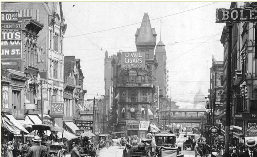
Main Street north from 11th Street, ca. 1898. The Vaughan's Diamond Building is at center.