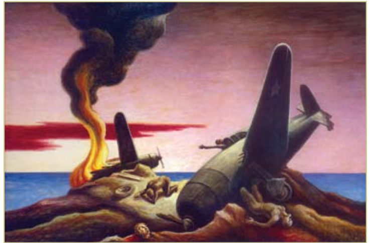
Indifference by Thomas Hart Benton

Starting with the May 2009 issue, the Missouri Times will be sent to participating members as a small digital file (less than five megabytes) attached to an e-mail message. This file will be compatible with most