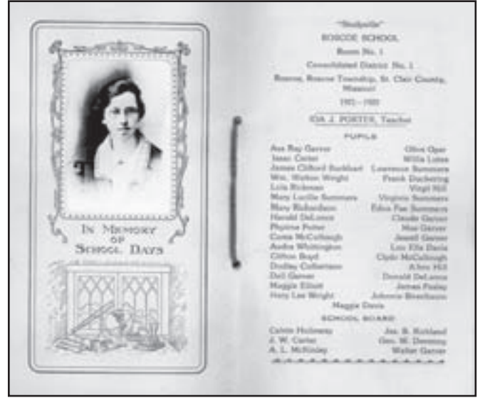
Souvenir of Roscoe School Room No. 1, Saint Clair County, 1922 (R1104)