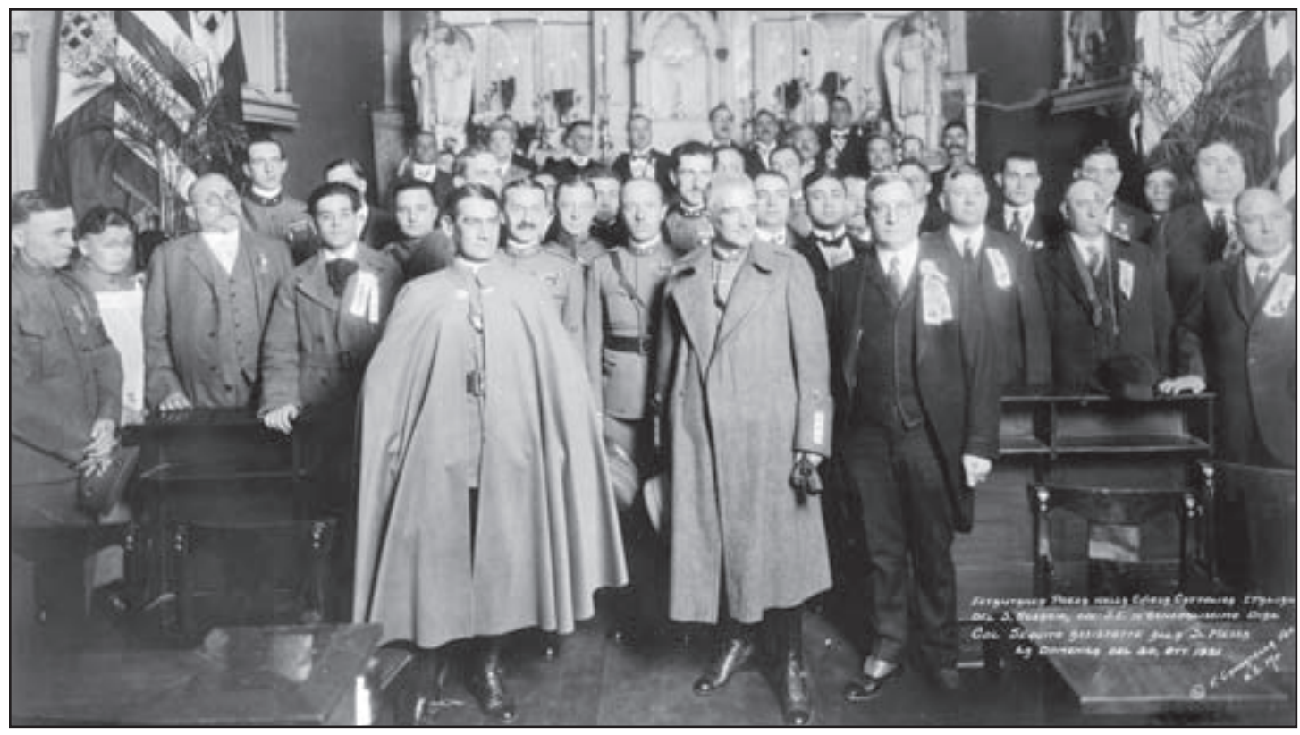
Local Italian dignitaries pose with General Armando Vittorio Diaz during his visit to Kansas City, October 30, 1921.