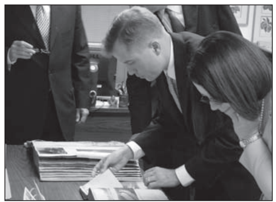
The governor enjoyed perusing the scrapbook created by previous Governor Lloyd Stark during his time as a Naval Academy midshipman.