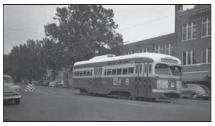
Jefferson Avenue Streetcar #1778 in front of Held Building on South Broadway

Passengers rode the PCC cars on the Jefferson Avenue line from the time they were introduced in 1946 until 1958 when the line was shut down. Minden also captured PCC streetcars coming out of the South Broadway Car House, a