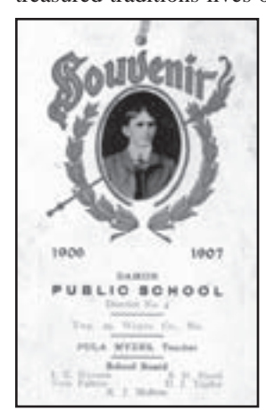
Souvenir of Damon School, Wayne County, 1907 (R0702)

Missouri's one-room rural schoolhouses are now largely forgotten or just fading memories for "old-timers," but one of their treasured traditions lives on at the Western Historical Manuscript