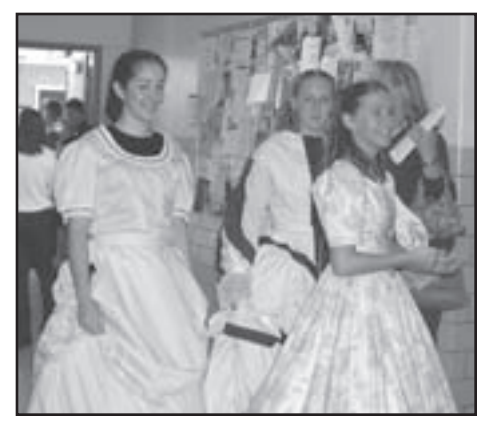
These students are excited to begin their performance at the NHDMO contest.