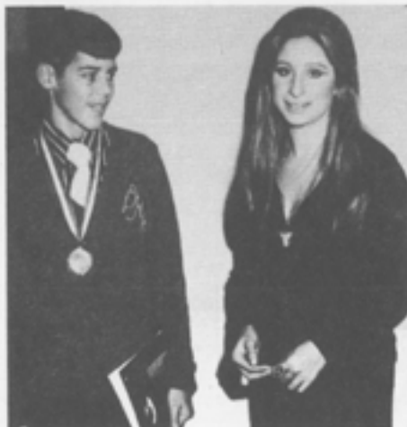
LA STREISAND congratulates winner