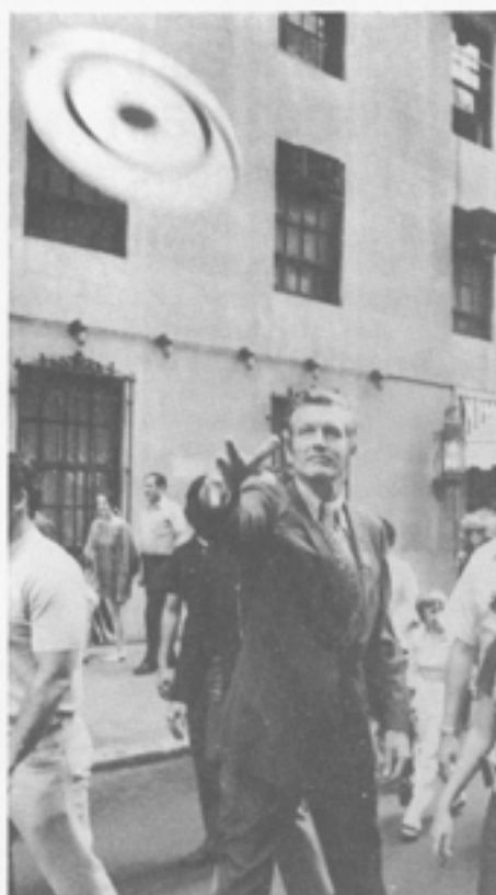
HIZZONER SHOWS HOW — John Lindsay, New York's most famous street walker, pauses during one of his jaunts to flip a friendly Frisbee.