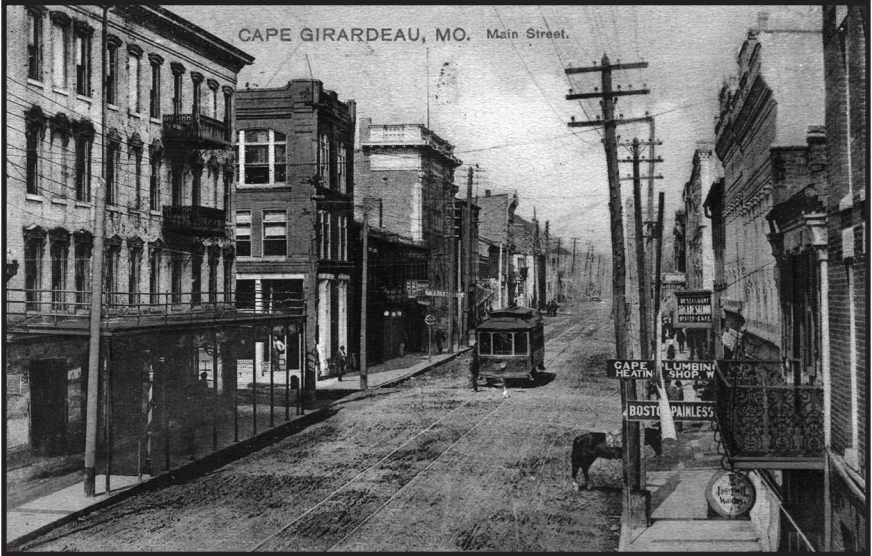
Cape Girardeau , early 1900s