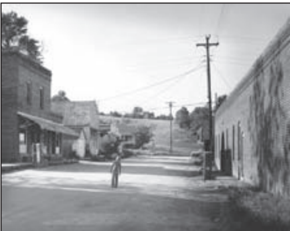
Wooldridge, Cooper County by Laurence Hedlund, from Missouri Cities: Images from the Permanent Collection

• Missouri Cities: Images from the Permanent Collection is on display in the Society's North-South Corridor Gallery through April 18, 2008. This exhibition features photographs, engravings, lithographs, drawings, and watercolors that depict Missouri's smaller towns and villages as well as the state's largest cities. Created by a wide variety of artists, the artworks and photos date from the nineteenth and twentieth centuries and showcase a range of talent.