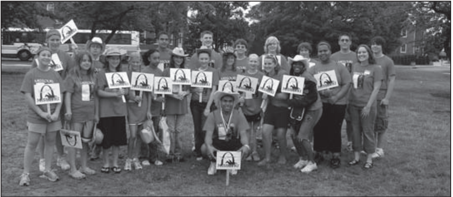
Missouri Delegates to the 2007 National History Day Contest, University of Maryland-College Park