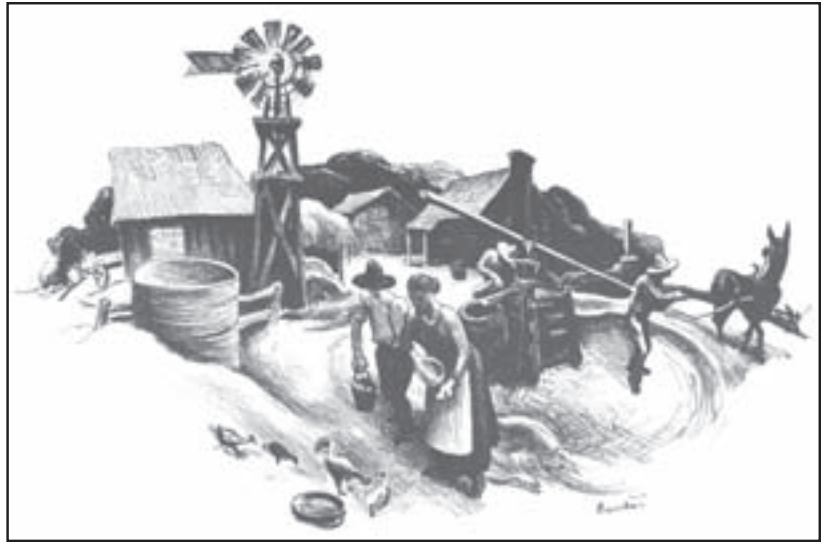
Missouri Farmyard by Thomas Hart Benton