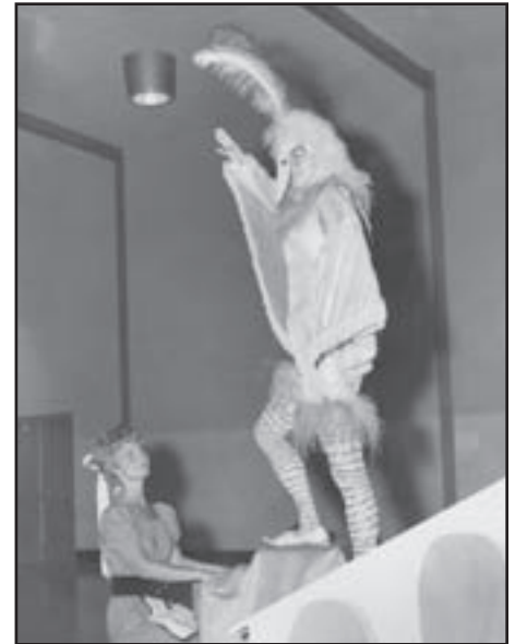
Call for the Goochoo Bird performed by the Tomahawk Junior Service League (1970).