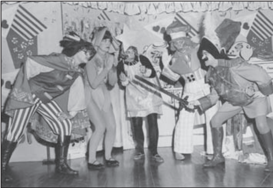
The Invisible People performed by the Musettes (1978).